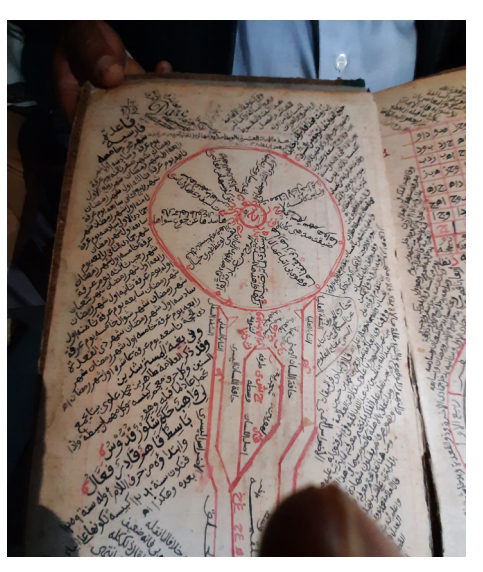
There has been Kebene and other local languages Ajami, but unfortunately, we could not find a Somali Ajami as we expected.